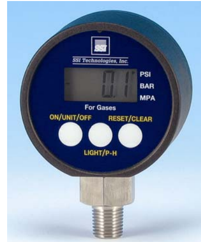
MediaGauge™ Model MG-9V and Model MG-9V-F

The MediaGauge™ MG-9V digital pressure gauge has better accuracy, longer life and standard multiple functions which make it a better choice than mechanical pressure gauges.